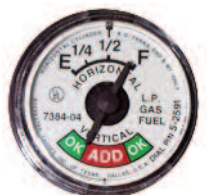
Snap-on Direct Reading