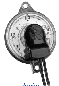
Junior Advanced Matrix TwinSite®