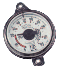
Junior Direct Reading