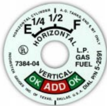
Dial S/A: 5714S02591

Conveniently located slots allow for easy removal of dial